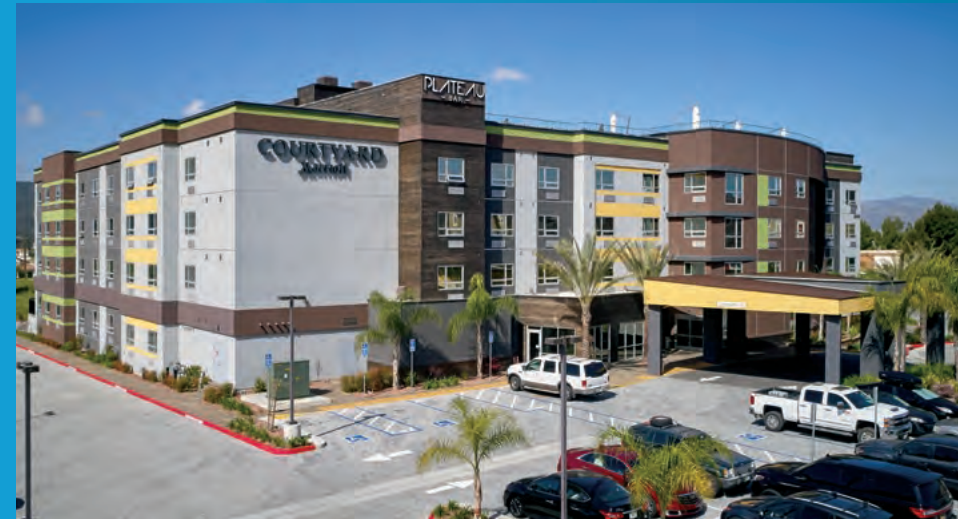
Courtyard Marriott opened 2018

The City is actively seeking developers that share the City's vision to fulfill a beautiful, new Downtown Specific Plan . Downtown Murrieta will feature a variety of mixed use projects, including retail, entertainment and residential along and around Washington Avenue, and will be anchored by the Civic Center which currently includes City Hall, the Police Station and Murrieta Public Library.